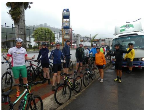
A Little Wet