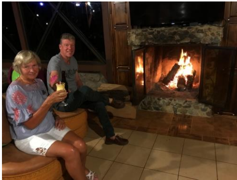
Pina Colada By The Fire