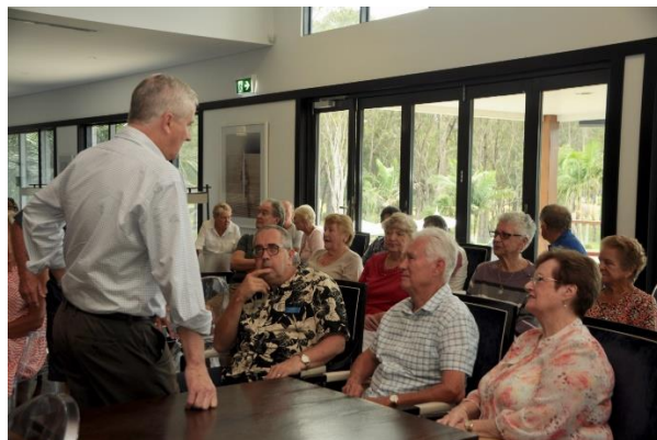
The Deputy Prime Minister talking with some of OCR's residents