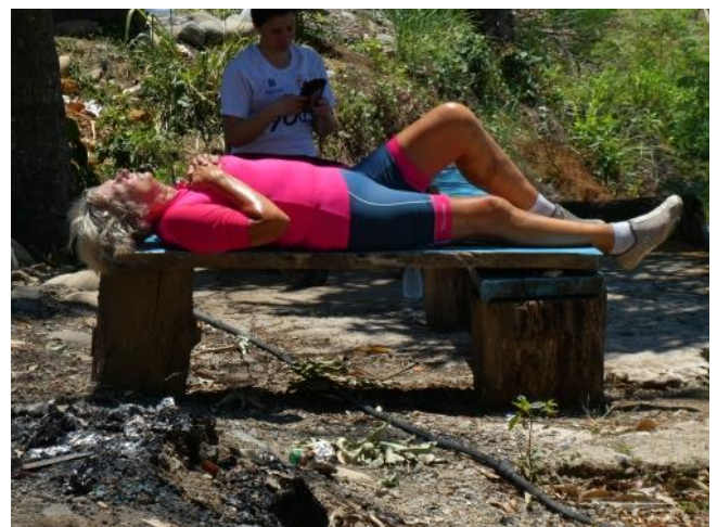
Time For A Rest