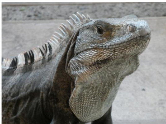
One Of The Locals