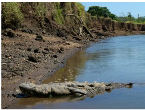
It's Just A Log