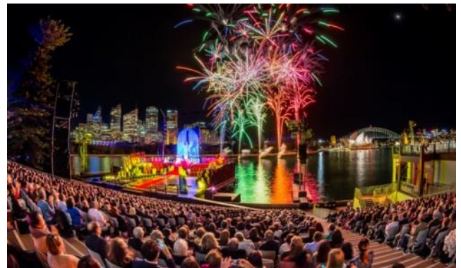
West Side Story on the Harbour