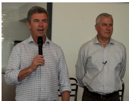
Left local Federal Member of Parliament, the Hon Dr David Gillespie MP and right Deputy Prime Minister, the Hon Michael McCormack MP

The Residents Committee is in the process of sending both Ministers letters to thank them for their time and attendance at Ocean Club Resort.